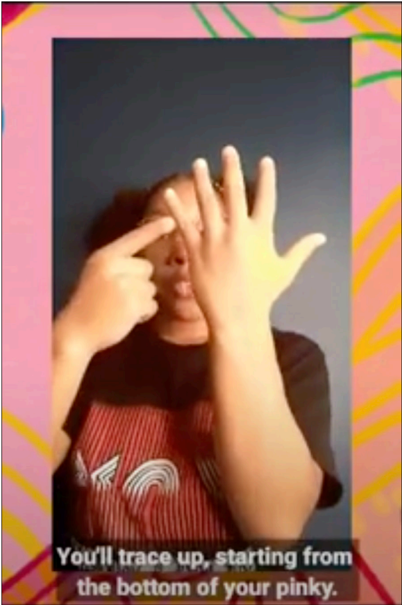
Mindful moment in action — a breath-based grounding technique

A mindful moment can be anything from taking a few deep breaths to a guided meditation. This illustrates practices participants can use on their own time, brings participants to the present, and settles the nervous system, increasing participants' abilities to engage.