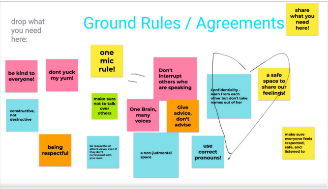
A photo of ground rules from our virtual space

When a group co-creates agreements (we call these “Ground Rules”), participants get to say what they need to feel brave and safe, and they develop a sense of ownership and shared responsibility for that space. This is another place for youth voice and leadership, and fosters SEL connected to social awareness, relationship skills, self-awareness and self-management.